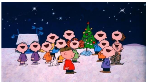
This Photo by Unknown Author is licensed