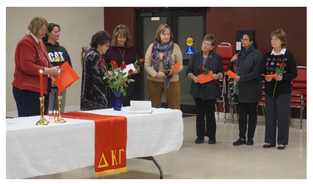
Initiation, December 12, 2016