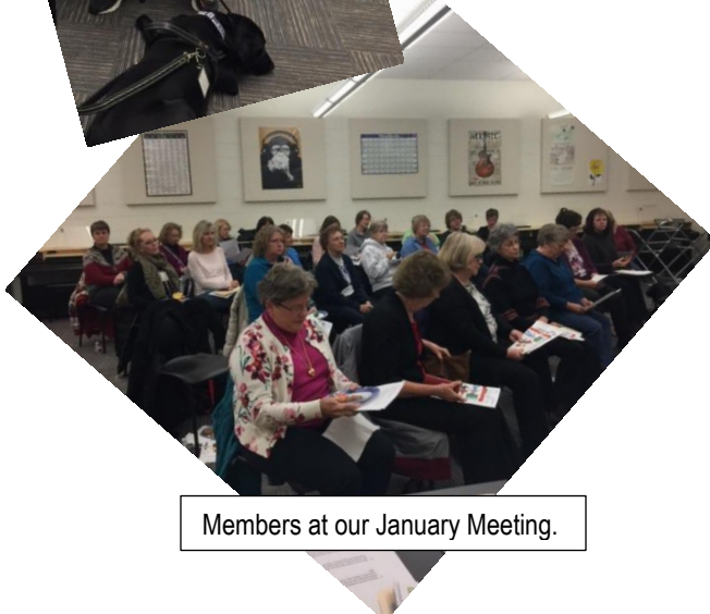
Members at our January Meeting.